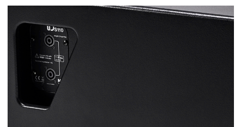
Rear panel connectivity / Touring version