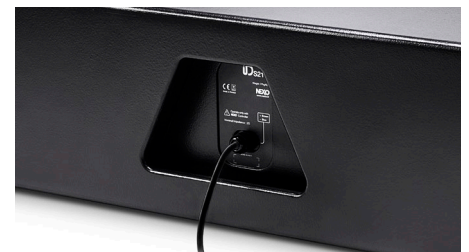
Rear panel connectivity / Installation version

IDS110 and IDS210 subs share the same phase response as other NEXO speakers, making them extremely easy to integrate in ID Series systems or systems using other NEXO modules.