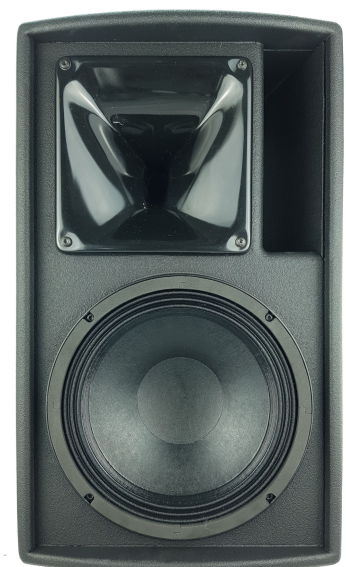
Grille removed, the large PS horn used with the HF driver

ePS10 acoustic phase response is NEXO phase signature allowing inter-operability between all NEXO speakers at all crossover points, except for the monitor setups where latency is minimized.